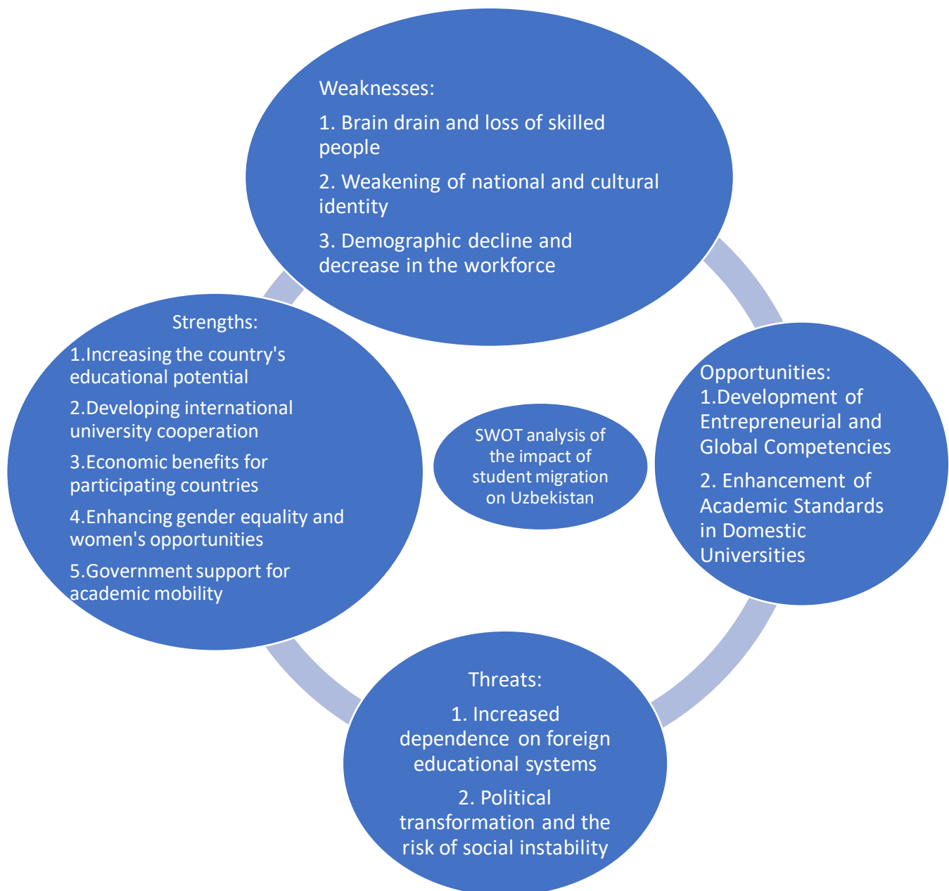
Figure 2. SWOT Analysis of the impact of student migration on Uzbekistan 5